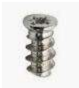
6.3mm x 10mm Screw-qty 4

(these screws are for cabinet shop CNC Install)