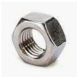
3/8" Hex Nut- Qty 4

(these screws are for cabinet shop CNC Install)