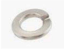
1/4" Split Lockwasher-qty 12