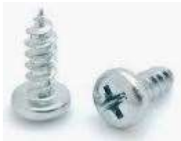
5/8" Pan Head Screw-qty 4