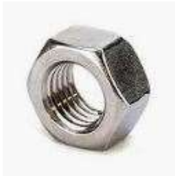
1/4" Hex Nut-qty 12