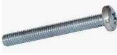
2 1/2" x 1/4" Machine Screw-qty 12